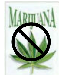
No shirts with drugs