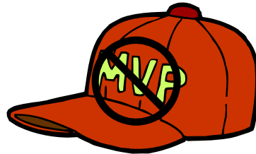
No altered caps, backpacks, notebooks