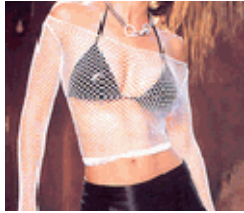
No see through or