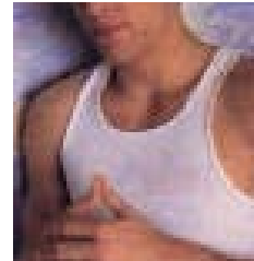
No muscle shirts