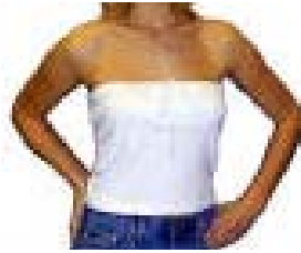
No strapless tops