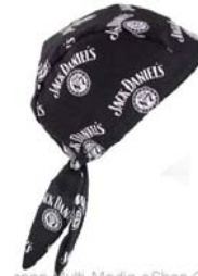
No bandanas No gang attire, no "colors"