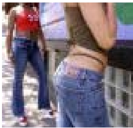
No exposed undergarments, male and female