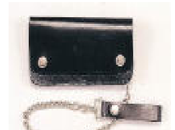
No Chains over 6" long