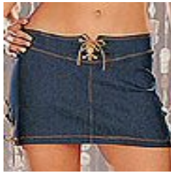
No short skirts